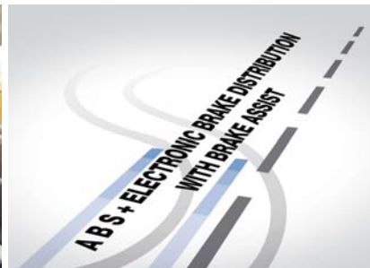
ABS + EBD with brake assist