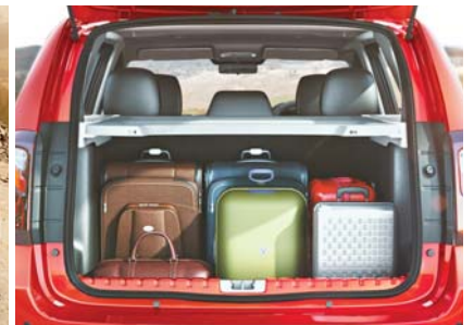
Boot space of 0.475 m 3 (475 litre)*, expandable up to 1.064 m 3 (1064 litre)