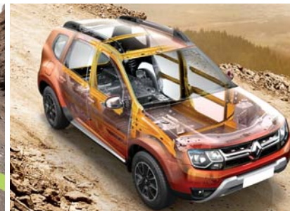
Sturdy monocoque body