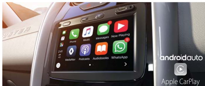
17.64 cm Touchscreen MediaNAV Evolution with Android Auto™ and Apple CarPlay Android Auto is a trademark of Google LLC.