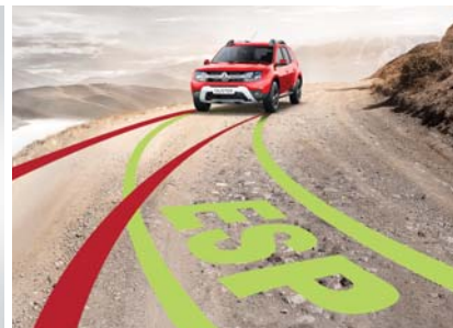
Electronic Stability Program