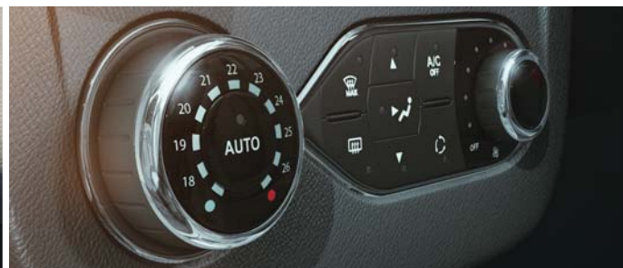
Automatic climate control