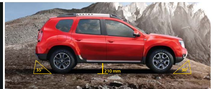
High ground clearance of 210 mm (AWD Variant)