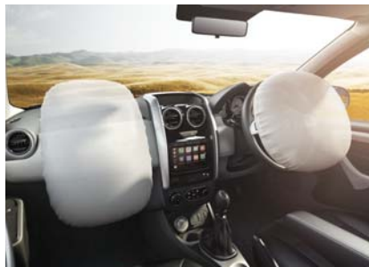
Dual front airbags

All Wheel Drive - The AWD feature allows the car to adapt to any kind of terrain and delivers an effortless driving experience.