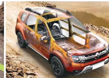
Sturdy monocoque body