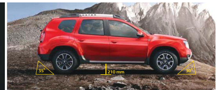
High ground clearance of 210 mm (AWD Variant)