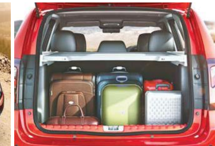
Boot space of 0.475 m 3 (475 litre)*, expandable up to 1.064 m 3 (1064 litre)