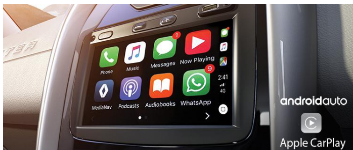
17.64 cm Touchscreen MediaNAV Evolution Android Auto is a trademark of Google LLC