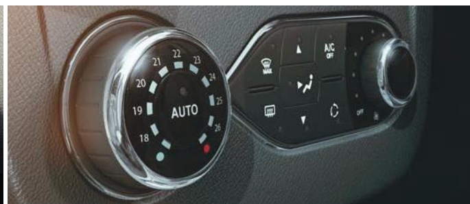
Automatic climate control