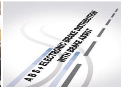
ABS + EBD with brake assist