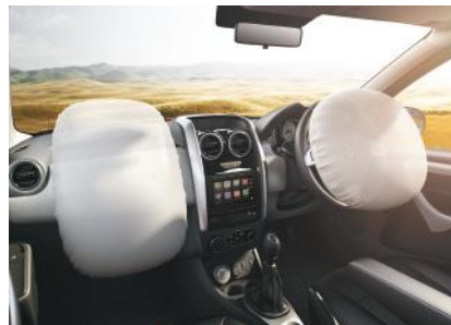
Dual front airbags

All Wheel Drive - The AWD feature allows the car to adapt to any kind of terrain and delivers an effortless driving experience.