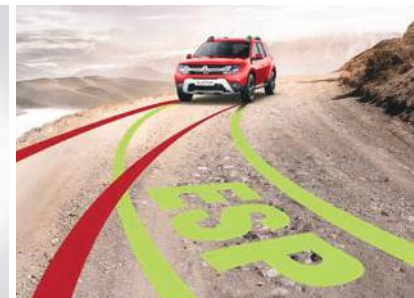
Electronic Stability Program