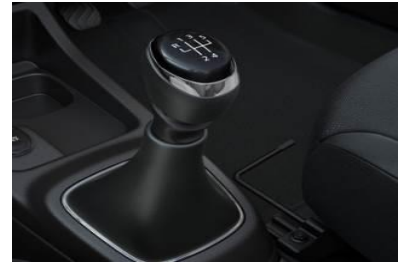
New chrome gear knob