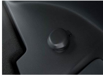
12V power socket