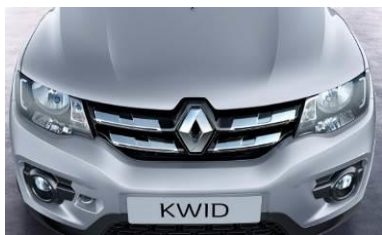
New Razor edge chrome front grille

Renault KWID has a powerful and significant road presence with dual tone bumpers, and other distinctive design elements including the “C” shaped Renault lighting signature. Up front, the RXT(O) variant of Renault KWID 2018 Feature Loaded Range gets an appealing new razor edge chrome front grille highlighting the Renault diamond logo, which accentuates the SUV-inspired design of the vehicle and add a touch of premiumness. The subtle design changes have brought forth a mature overall stance in line with its all-terrain attitude. In terms of standard features, the mid-level and top-end variants get