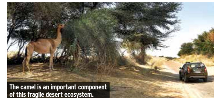
The camel is an important component of this fragile desert ecosystem.

Renault, who set out to establish a community of Duster lovers, has set the ball rolling with this initiative. The company promises many more exciting and longer drives in the calendar year. Unfortunately, as of yet, it is only open to Duster owners. If you are one, keep an eye out for announcements on their website. If this drive was any indication, this Gang of Dusters is ready to go where no gang has gone before. AI