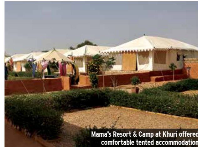
Mama's Resort & Camp at Khuri offered comfortable tented accommodation.