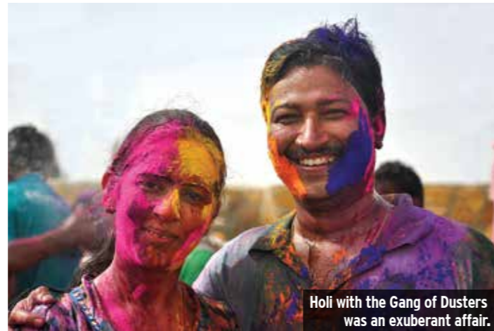
Holi with the Gang of Dusters was an exuberant affair.