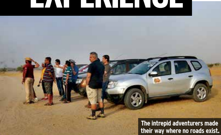
The intrepid adventurers made their way where no roads exist.